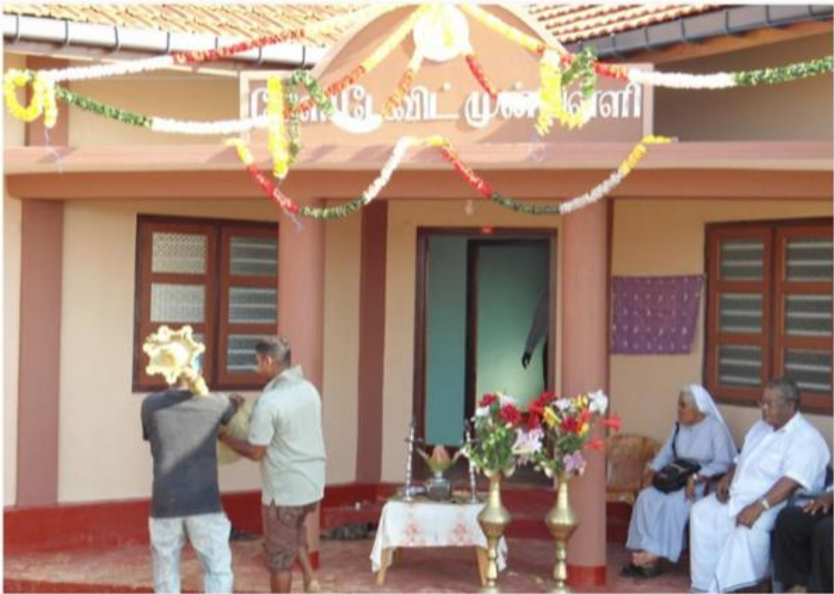
PEARLY DAVID PRE SCHOOL, ALLAP[IDDY