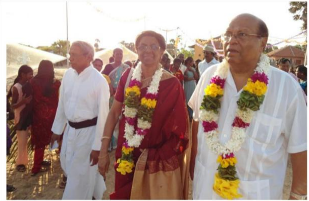
This picture was taken on the day of the opening of the Pearly Pre School on March 12, 2012